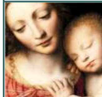
Mary, Mother of God